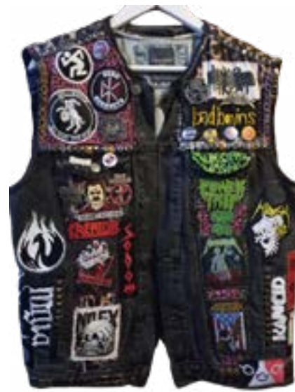
a sick vest by u/DrH1983