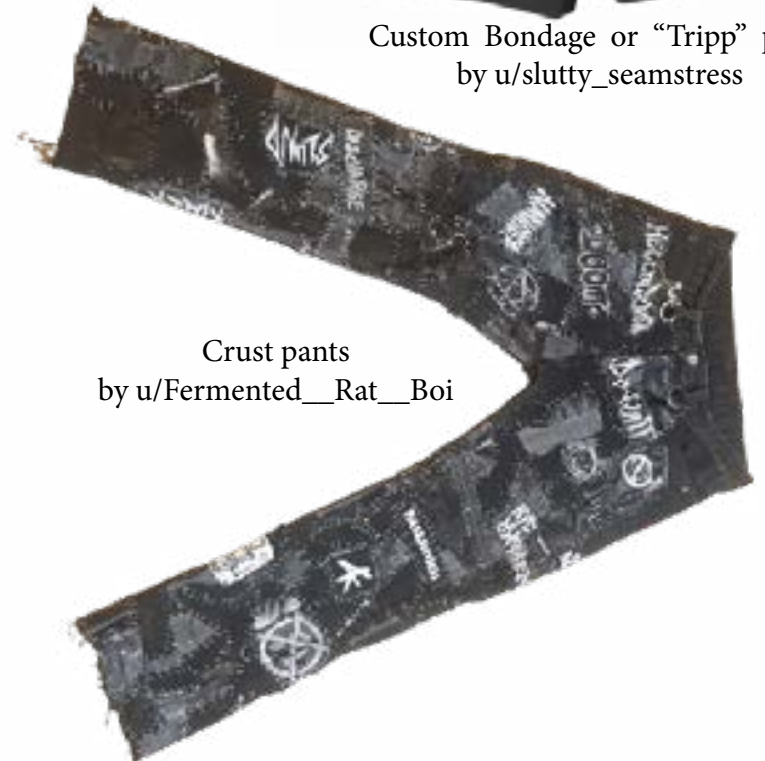
Crust pants by u/Fermented__Rat__Boi