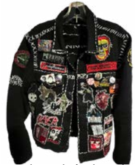
a good example for those who like sleeves, by u/officialjakefinlive