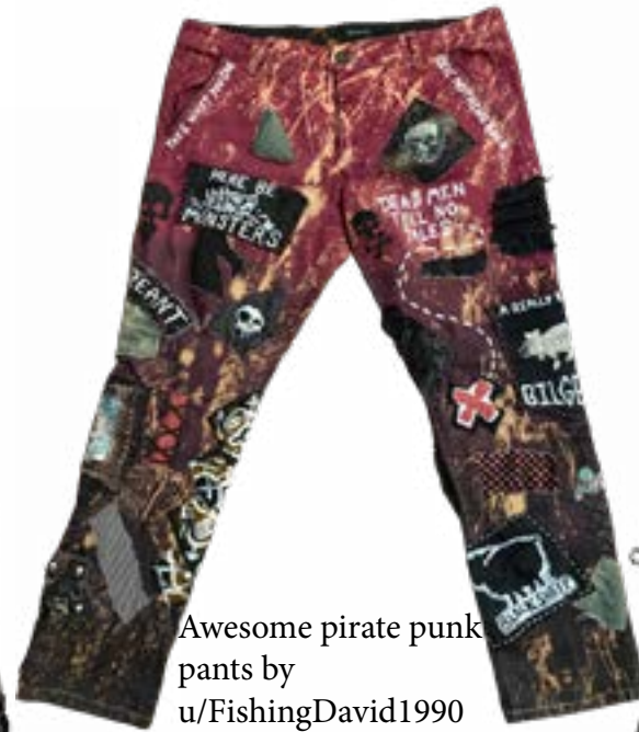
Awesome pirate punk pants by u/FishingDavid1990 YARRGH!