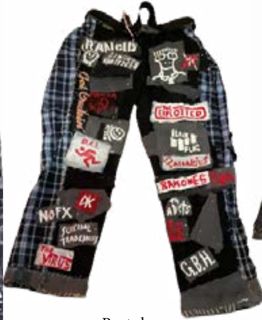
Pants by u/The-neverine