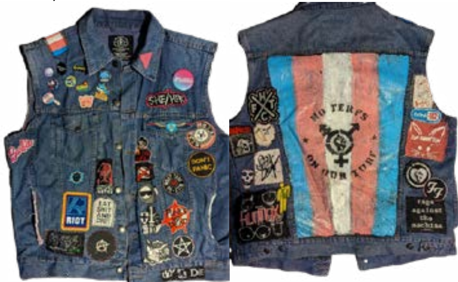
My main vest that I wear everyday

Every punk tends to at least sport the battle jacket (or vest), what goes on it is ultimately up to you. Paint it, sew on patches, stick some safety pins and buttons on there, there is no wrong way to do this. And if they tell you otherwise, they're not really punk. The battle jacket is an extension of yourself, if there's anything that you want people to absolutely know about you, put it on the jacket!