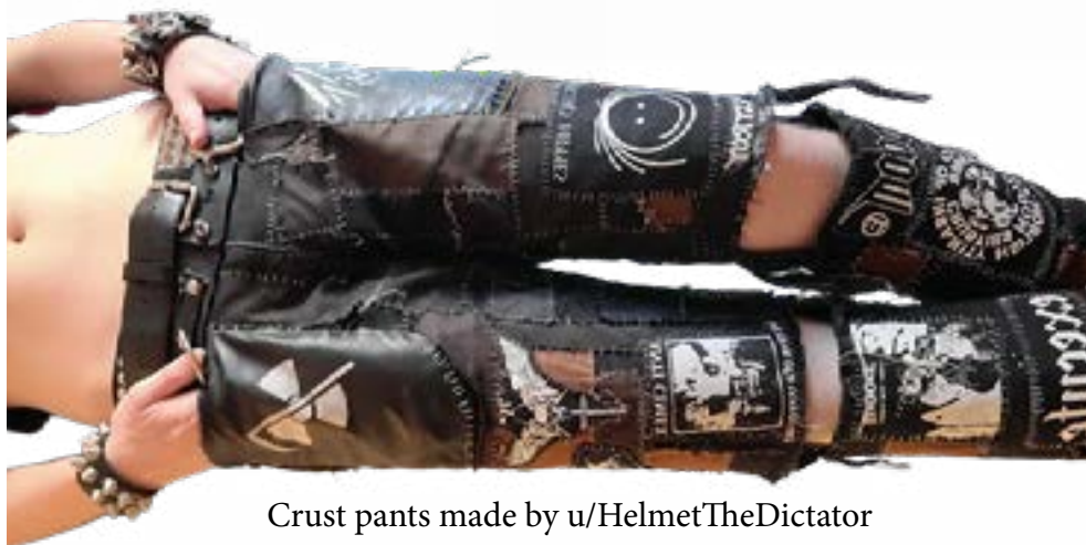
Crust pants made by u/HelmetTheDictator