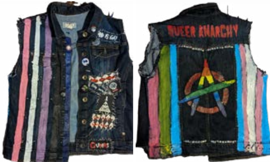
My vest from when I thought I was pansexual