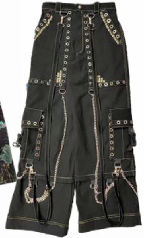
Custom Bondage or "Tripp" pants by u/slutty_seamstress