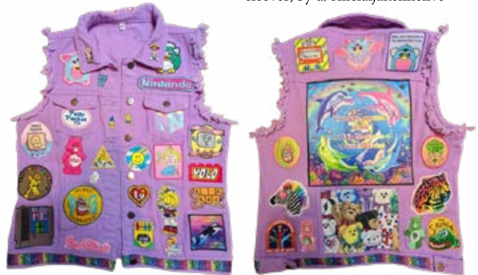
Color is allowed! Look at this sweet vest by u/discordiadystopia

Looking for inspiration online? I recommend the subreddits r/jacketsforbattle and r/punkfashion . I encourage you to stay far, far away from r/battlejackets as the mods are known for fascist behavior.