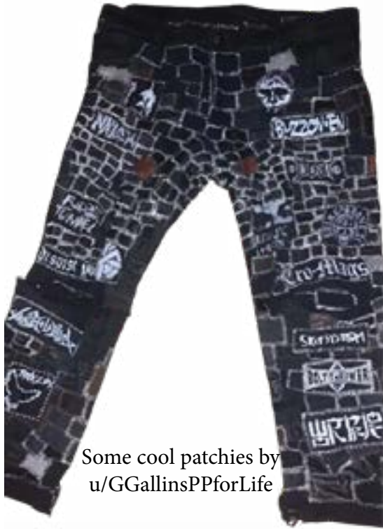
Some cool patchies by u/GGallinsPPforLife