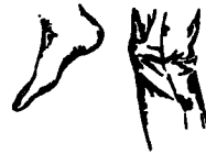
Lift foot high and maintain balance.