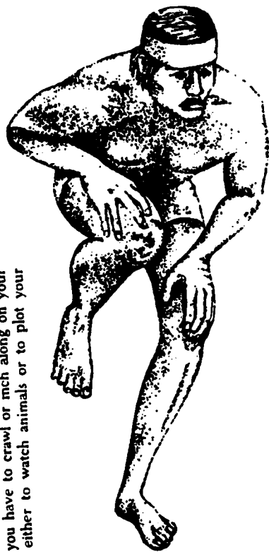
Stalking crouch, bracing hands on knees for extra support.

There are two types of cover: primary and secondary. Primary cover is anything so thick that you can't see through it. This might be a tree stump, a tangle of brush, or even a field of tall grass. Secondary cover is composed of thinner material such as leafy branches that do not completely obscure your view. When stalking, keep most of your body hidden behind primary cover, even if you have to crawl or inch along on your belly. Utilize secondary cover either to watch animals or to plot your direction.