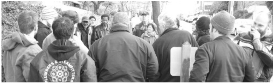
This pamphlet was created by the Workers Solidarity Alliance ideasandaction.info // workersolidarity.org