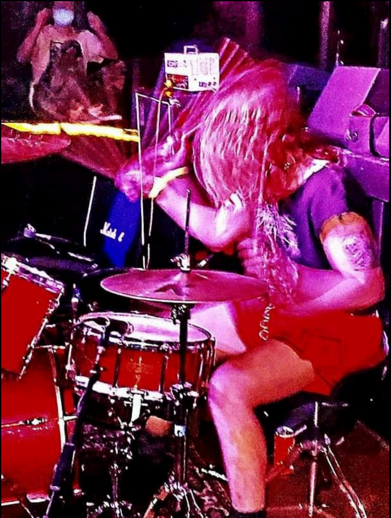
band in the photos is Brain Tourniquet